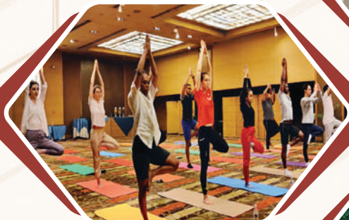
Special Yoga Session