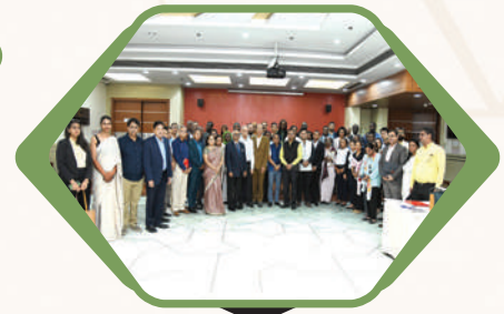
Interactive session at FICCI