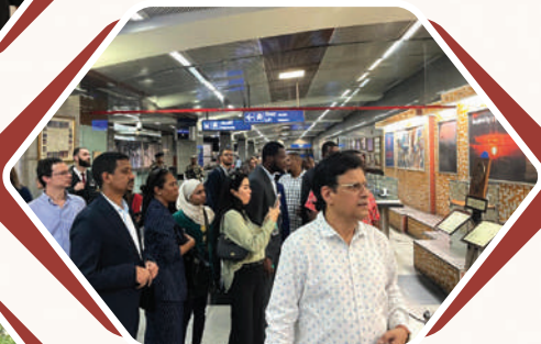
Visit to Delhi Metro Museum