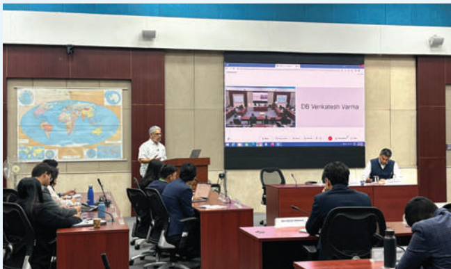
A day-long technology module organized by Carnegie India

including a one-day technology module by Carnegie India; consular, visa and passport issues, passport sewa project, crisis management, diaspora engagement, emigration policy, paper presentations, etc.