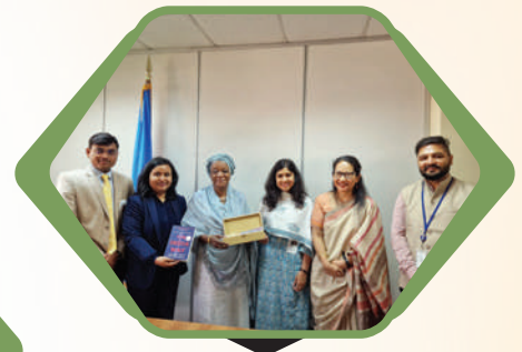
OTs met with DG, United Nations Office at Nairobi, Kenya