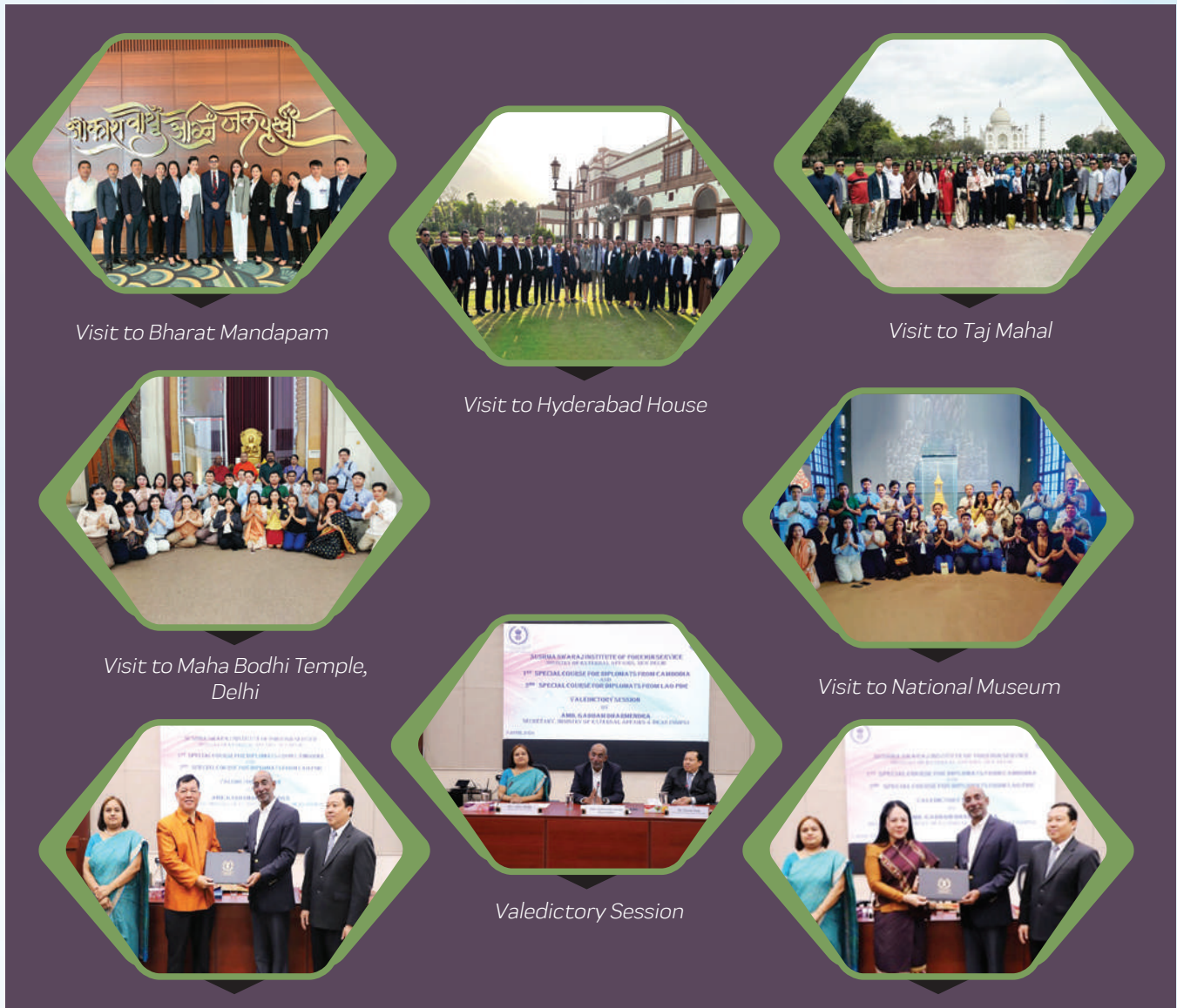
Visit to Bharat Mandapam