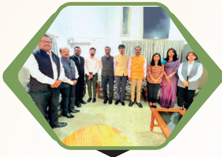
OTs at the Consulate General of India, Birgunj, Nepal