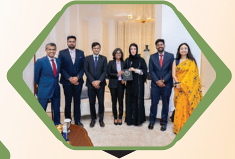
Call on MoS for Foreign Affairs of UAE