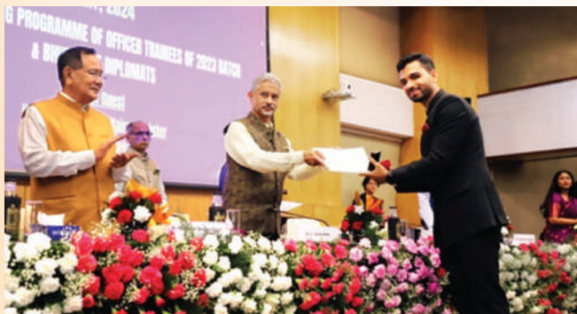
EAM's Gold Medal