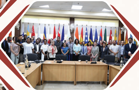
Visit to International Solar Alliance