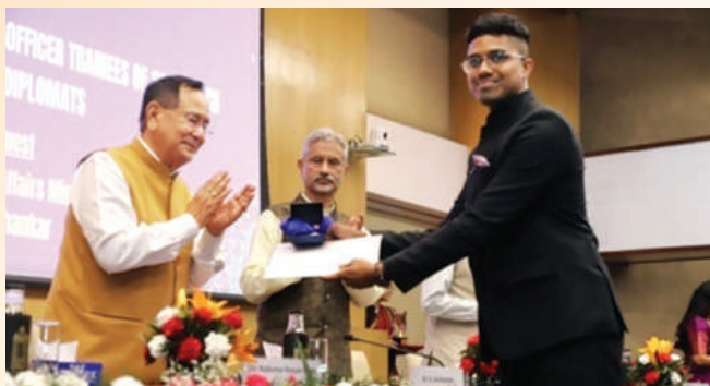
Silver Medal (Esprit d'corps)