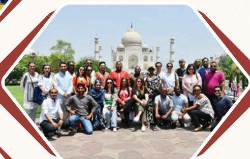
Visit to Taj Mahal