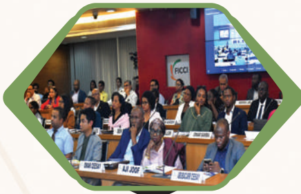
Interactive session at FICCI