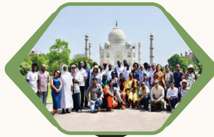
Visit to Taj Mahal