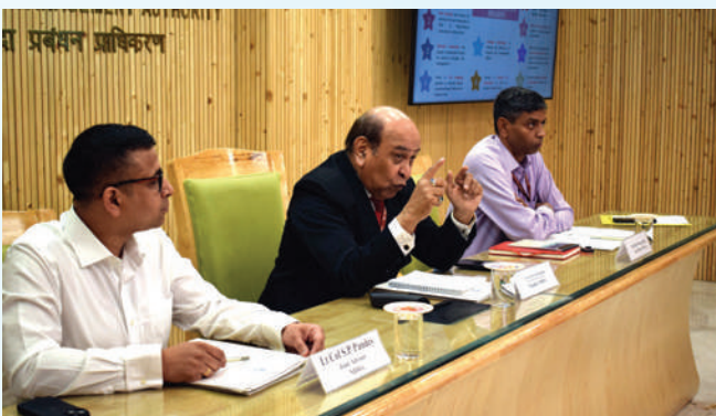
Module at the National Disaster Management Authority, New Delhi