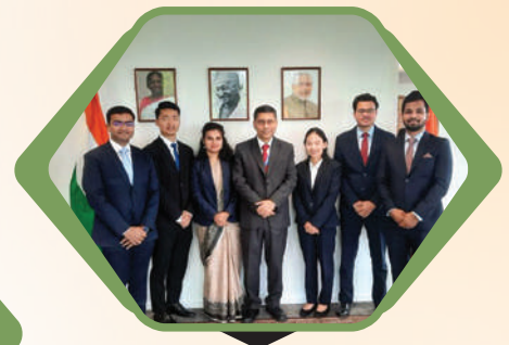
OTs called on PR of India to the UN in Geneva