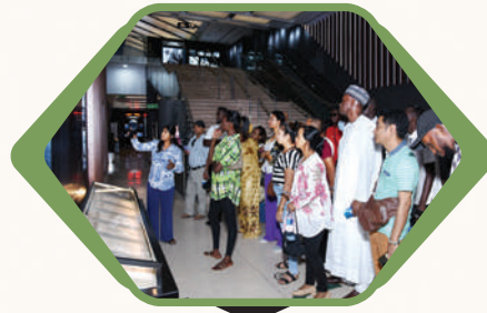
Visit to Pradhanmantri Sangrahalaya