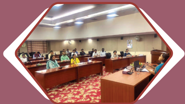
Promotion related Training Programme for Stenographers and PAs