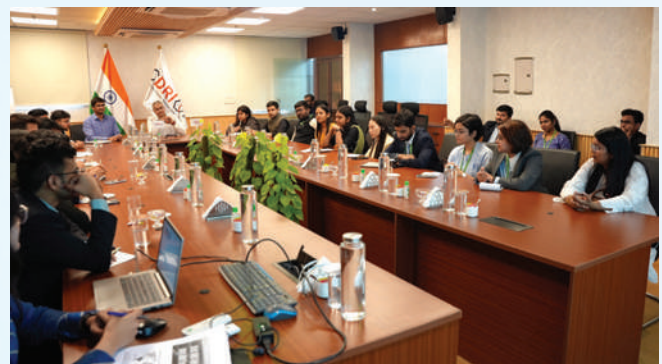
Visit to CDRI, New Delhi

The OTs and the Bhutanese diplomats were attached to various entities in New Delhi such as NDMA, CDRI, Parliamentary Research and Training Institute for Democracies (PRIDE), the External Publicity & Public Diplomacy and Protocol Divisions of the Ministry of External Affairs.