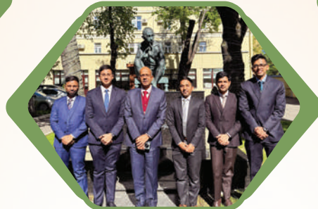
OTs called on Ambassador of India to Russia