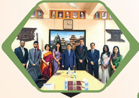
Call on Deputy Prime Minister of Nepal

the OTs underwent week-long Attachments with our Missions in Bangladesh, China, Kenya, Nepal, Russia, Sri Lanka, Switzerland, UAE, and USA in April 2024.