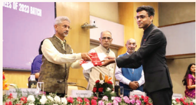
Bimal Sanyal Medal