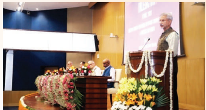
EAM at the Valedictory Function