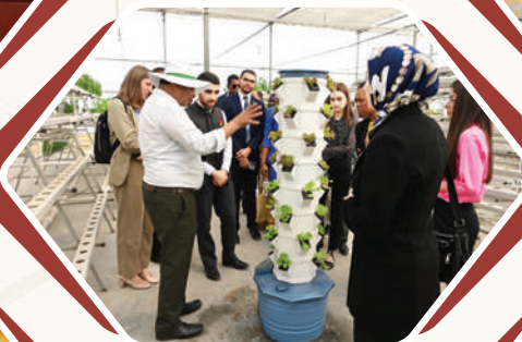
Visit to Indian Council of Agricultural Research