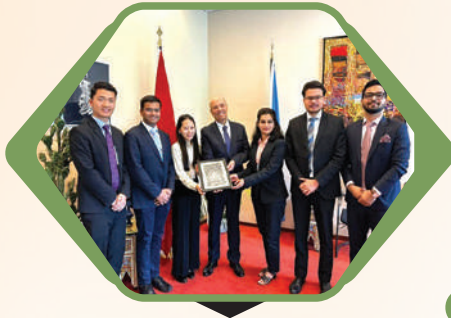
Meeting with HRC President in Geneva