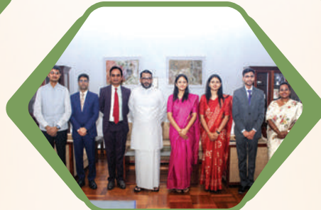
Call on State Minister of Sri Lanka