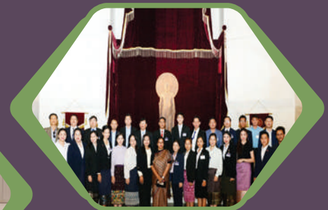
Visit to Rashtrapati Bhawan