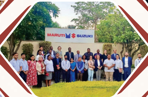
Visit to Maruti Plant