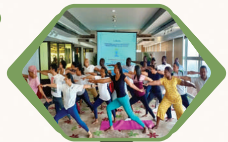
Special Yoga Session on IDY 2024